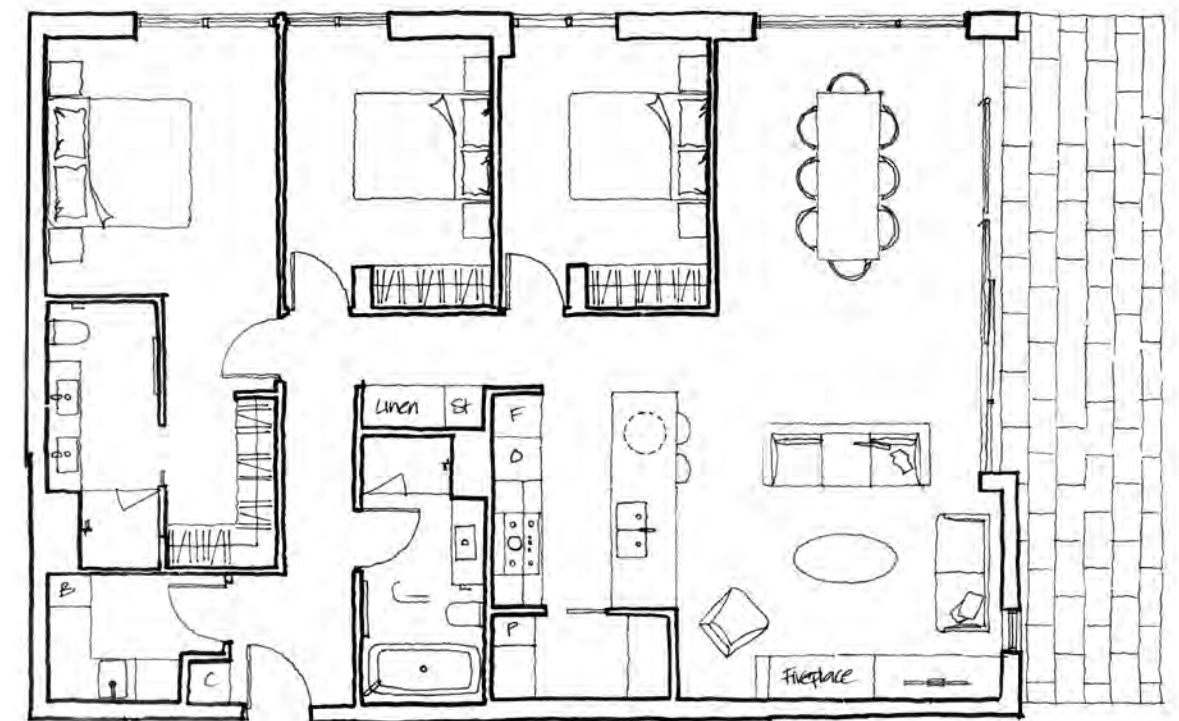
A - PRELIMINARY INTERIORS CONCEPT

"A refined and timeless interior that makes no compromises on quality defines Élan. Each facet of the design has been thoroughly contemplated, ensuring the space offers the luxuries only found in a home."