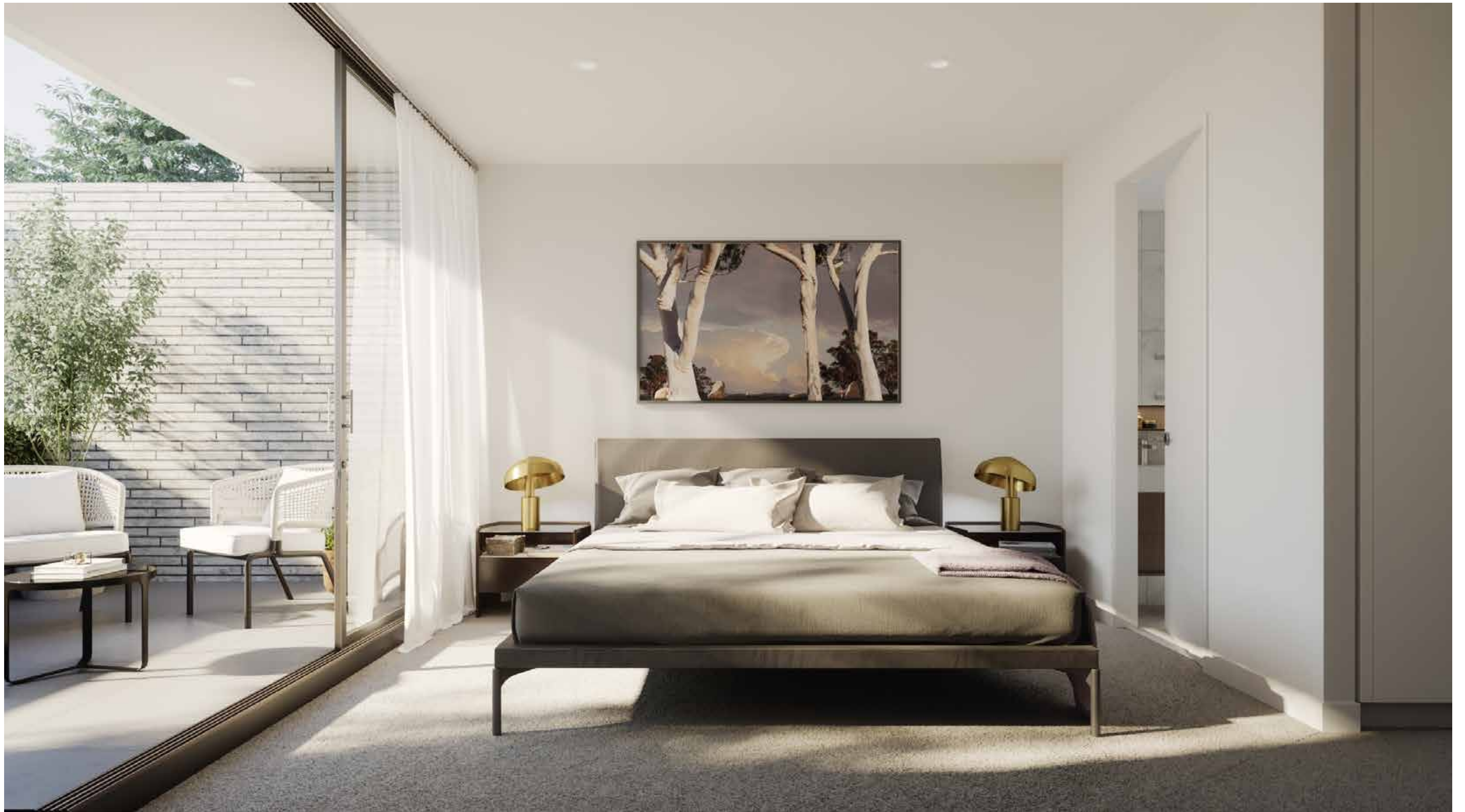
ARTIST IMPRESSION OF BEDROOM Élan's bedroom is founded on a natural palette with timeless elegance, evoking a sense of 'home' through plush wool carpeting and walk-in robes.