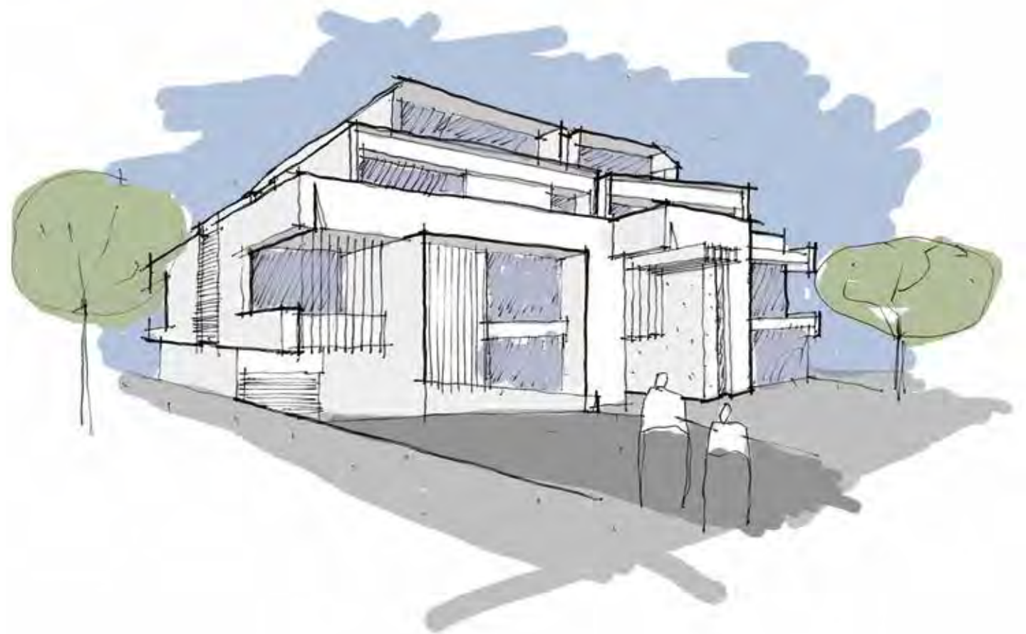
A - PRELIMINARY SKETCH OF FACADE